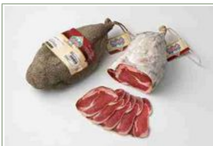
Cured and saused pork shoulder natural and peppered

Weight unit: 0,7 Kg. Units per box: 7 Units Shelf life: 184 Days. EAN 13: 8424924005620