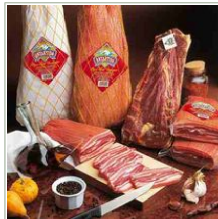
Cured bacon pieces