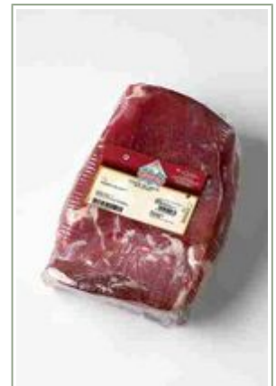
SERRANO HAM CENTER MOLDING & POLISHED