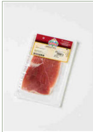
Serrano ham sliced 100 gr.

Weight unit: 0,100 Kg. Units per box: 20 Units Shelf life: 155 Days. EAN 13: 8424924007761