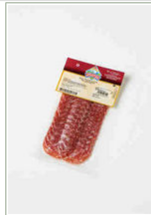
Sliced extra dried sausage

Weight unit: 0,100 Kg. Units per box: 20 Units Shelf life: 155 Days. EAN 13: 8424924007259