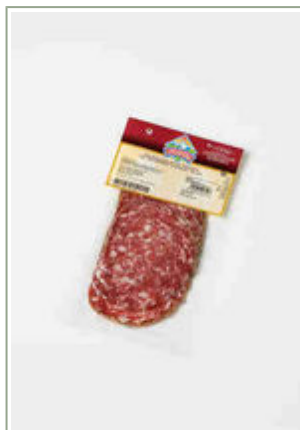
Extra dried sausage peppered sliced 100 gr

Weight unit: 0,100 Kg. Units per box: 20 Units Shelf life: 155 Days. EAN 13: 8424924007297