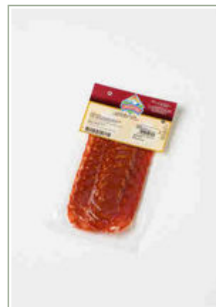
100 gr sliced chorizo extra

Weight unit: 0,100 Kg. Units per box: 20 Units Shelf life: 155 Days. EAN 13: 8424924007280