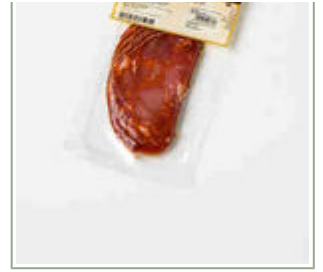
Chorizo with pepper sliced 100 gr

Weight unit: 0,100 Kg Units per box: 20 Units Caducidad: 155 Days. EAN 13: 8424924007334