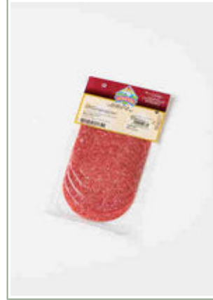
Salami export quality, sliced 100 gr